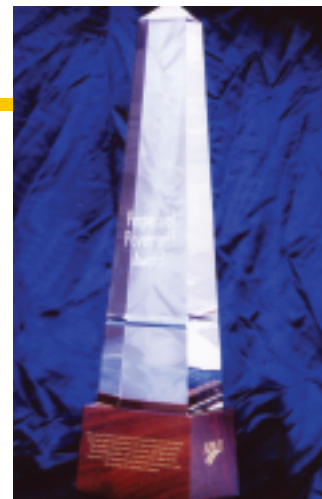
The Perpetual Pavement crystal obelisk