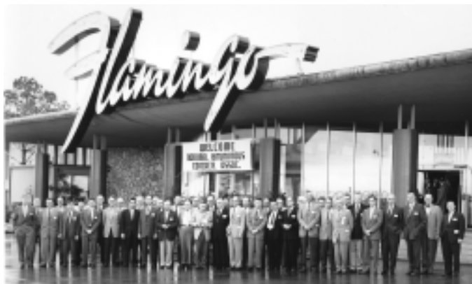
NAPA was originally known as the National Bituminous Concrete Association. Members gathered in Las Vegas for the 3rd annual convention in 1958.

provides technical, educational, and marketing materials and information to its members, and supplies technical information on paving materials.